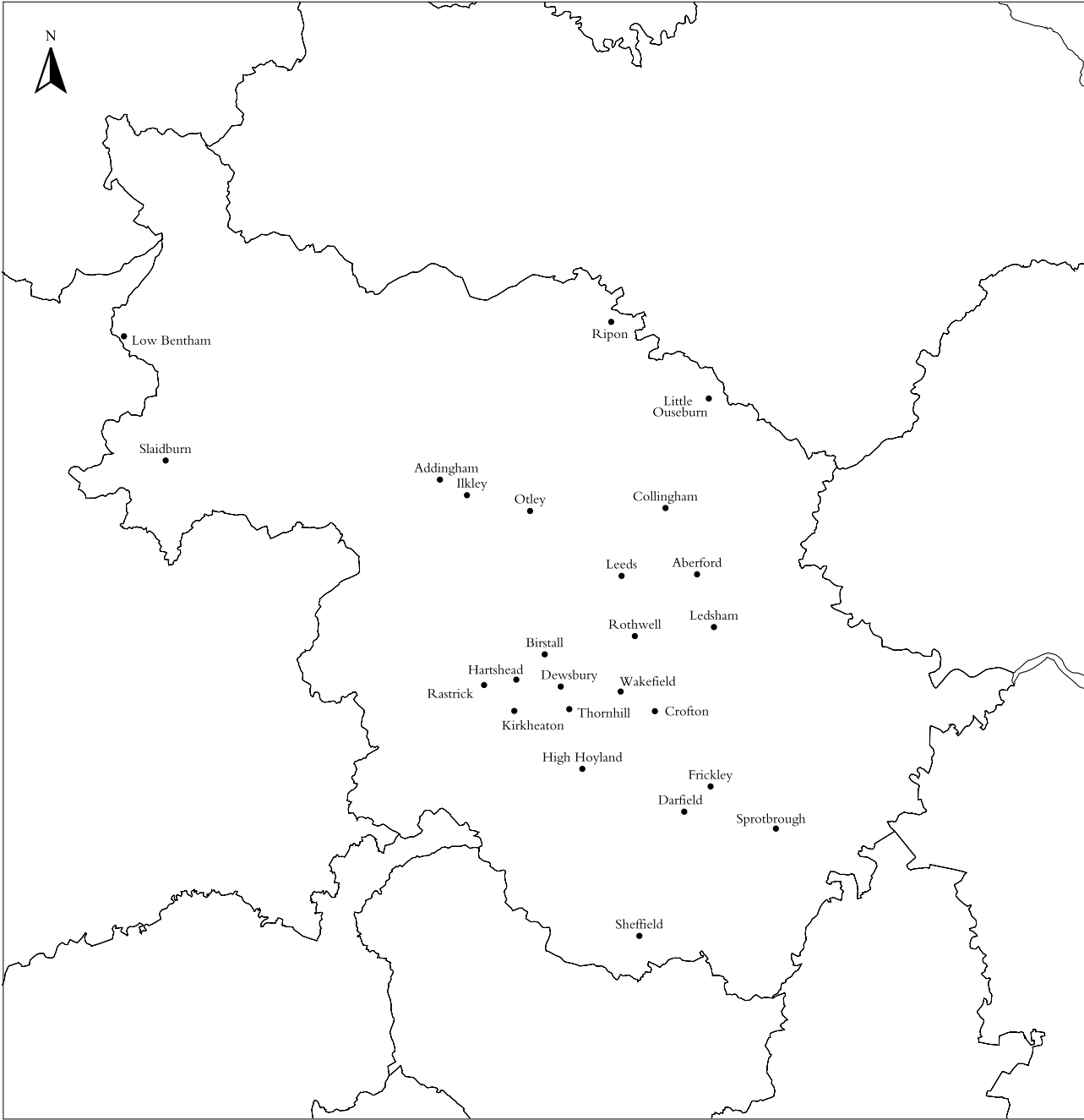
FIGURE 4 Sites with sculpture earlier than c. 925