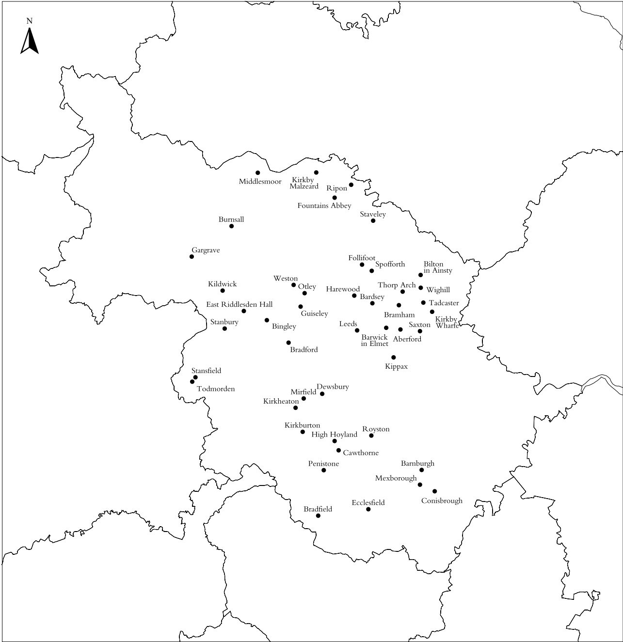
FIGURE 5 Sites with sculpture of the tenth to eleventh centuries